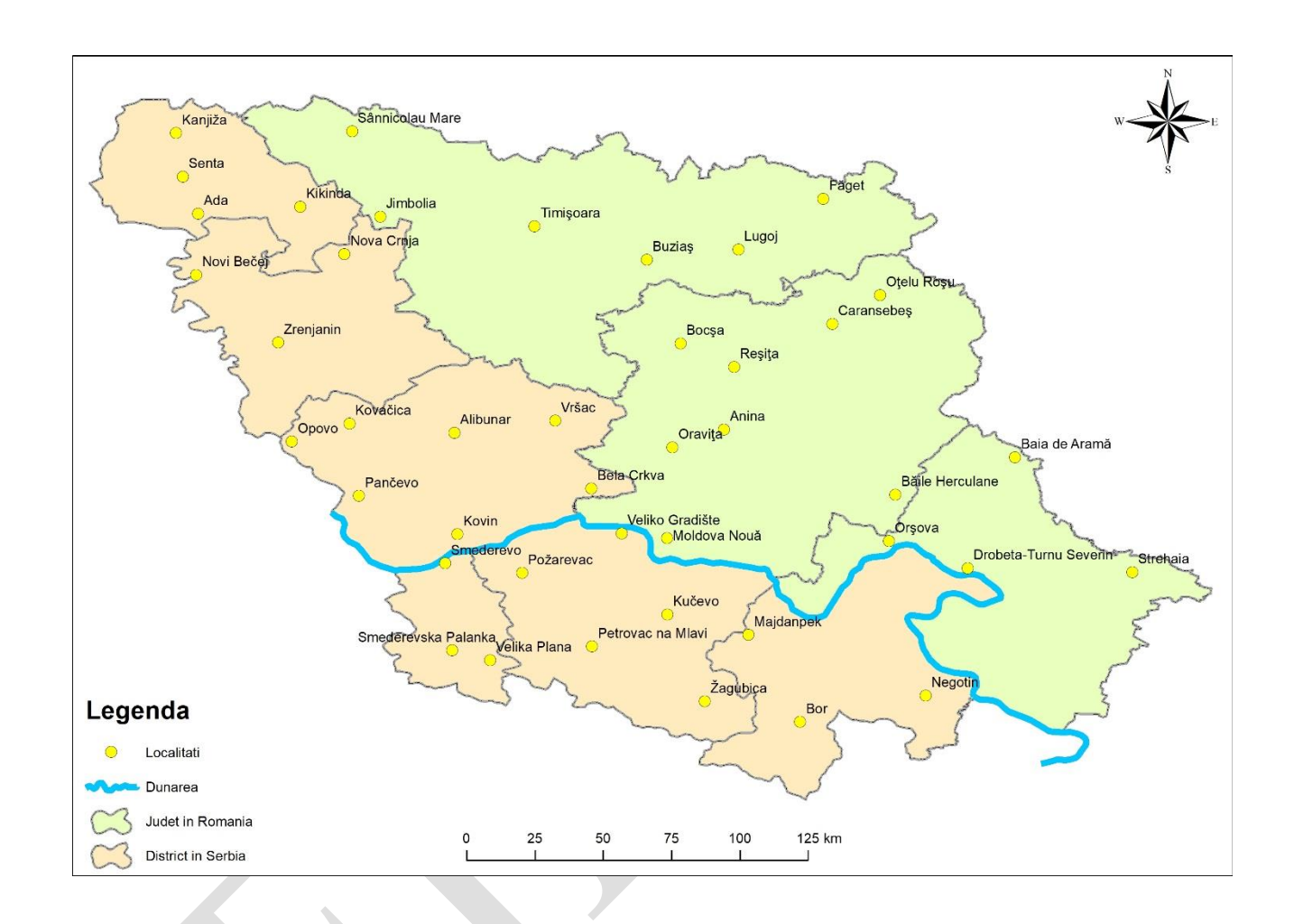
Map Map of the programme area