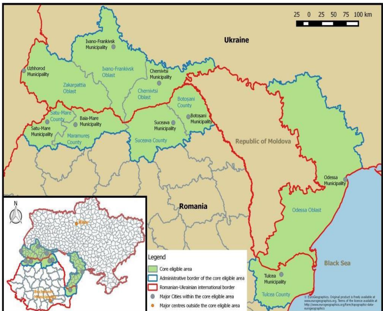
Map 2 Programme core area