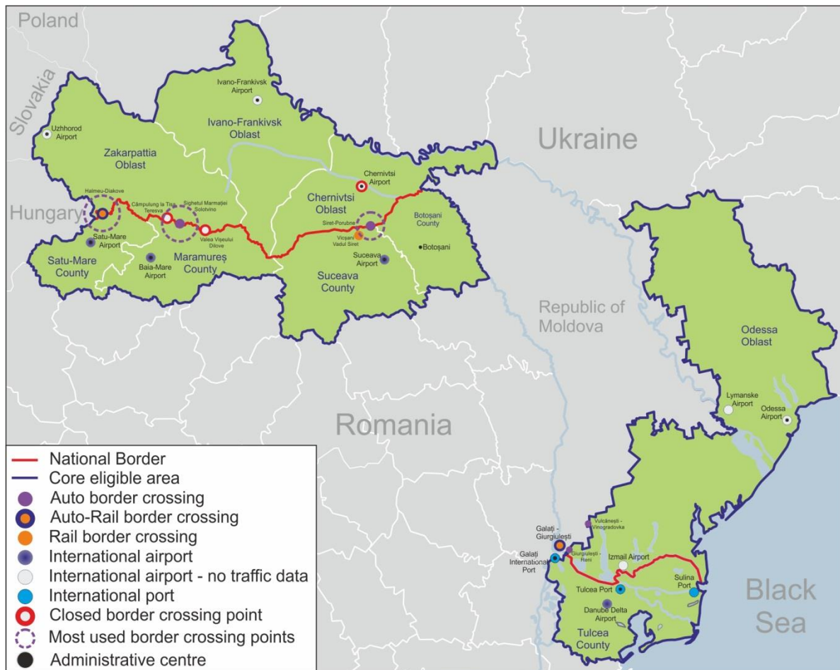
Map 1: Core area of the programme