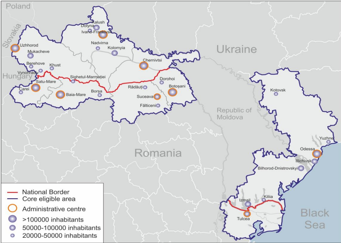
Map 4: Main cities in the core eligible area by size of population

Moreover, the level of development of the infrastructure is not always consistent at territorial level. Urban localities have better connectivity to public utilities and services than rural ones. This is an important issue as with the exception of Maramureş County and Odessa Oblast, a large majority of the population still lives in rural localities.